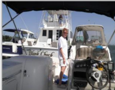
Raft-up at Dragon’s Point Where is everyone?